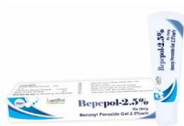
BENZOYL PEROXIDE GEL 2.5%

We also manufacture a lot of products for external application including a huge variety of ointments, drops and creams. We at MediPol follow stringent quality standards to ensure that all the products being manufactured are consistently safe, effective and of prime quality. We manufacture around 22.5 million tubes and 45 million bottles of pharmaceuticals of external section. Some of the products in this section are Sodium Fusidate Ointment, Medimycetin Ear Drops and Beclomethasone Dipropionate Phenylephrine, Sodium Chloride Nasal Drops, Silver Sulphadiazine Cream IP, Scabipol Cream and many more items.