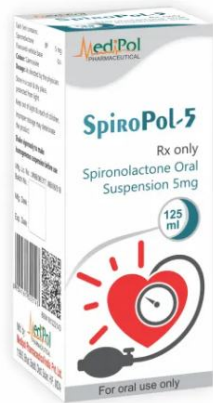
SPIRONOLACTONE ORAL SUSPENSION 5MG

We recognize that we must earn the trust and confidence of our customers every day, not only through the efficacy and safety of our products, but also through the quality of their manufacture as well. So, we remain committed to the production of prime quality of liquid pharmaceuticals with a manufacturing capacity of about 135 million bottles per year. Some of the products of this section are- Mucopol, Potassium Chloride Oral Solution, Polgene-M, Minrovet Z, Calzitrol C, Azithromycin Oral Solution and many more items at its best, with utmost quality.