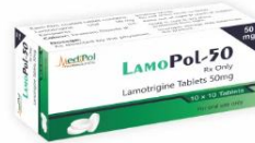
LAMOTRIGINE TABLETS 50MG