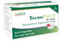
TACROLIMUS CAPSULES 5MG