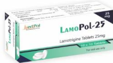
LAMOTRIGINE TABLETS 25MG