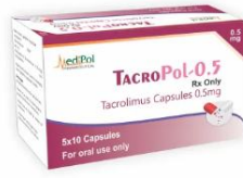
TACROLIMUS CAPSULES 0.5MG