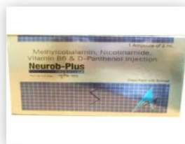
NEUROB PLUS INJECTIONS