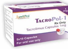
TACROLIMUS CAPSULE 1MG