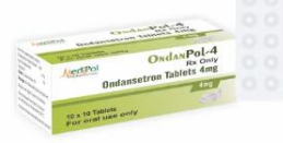
ONDANSETRON HYDROCHLORIDE TABLETS 4MG