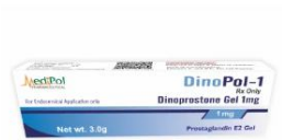
DINOPROSTONE GEL 1MG