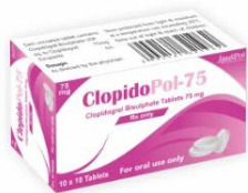
CLOPIDOGREL BISULPHATE TABLET 75MG

At MediPol, we remain committed to producing quality tablets and fulfilling the needs of the patients. With a manufacturing capacity of 3.6 billion tablets per year and more than 2 decades of experience, using innovative technologies, we are able to provide safe and trustable tablets. In order to assure the product quality and maintain the market supply of safe products, we have established a scientifically verified process of production management that extends from the import of raw materials to production and distribution. Some of the tablets that we manufacture are Cholecalciferol Tab, Minrovat CZS, Pyroplet, Metformin Hydrochloride TAB, Etophylline and Theophylline Tab, Zinc Sulphate Dispersible Tab, Cephalexin Dispersible Tab, Amoxicillin Tab and many more.