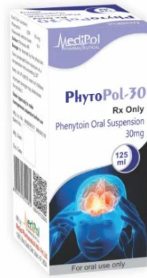
PHENYTOIN SODIUM ORAL SUSPENSION 30MG