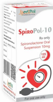
SPIRONOLACTONE ORAL SUSPENSION 10MG