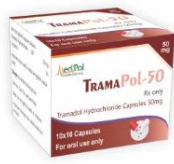
TRAMADOL HYDROCHLORIDE CAPSULE 50MG

Pioneers in the industry, we are engaged in offering highly effective and reliable capsules. The entire assortment of the offered products is tested on certain quality stages to ensure the delivery of defect-free and effective range to the clients' premises. Furthermore, these are available at the most affordable prices. Around 1.8 billion capsules are produced yearly at our manufacturing facility. Some of the capsules that we manufacture are Spirulina, Vitamins & Minerals Capsules, Francoplex Capsules, Neurob Plus Capsules, Alfalcaldol Capsules, Cefactor Capsules, Cloxacillin capsules, Cephalexin Capsules and many more items.