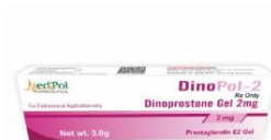
DINOPROSTONE GEL 2MG