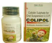
COLIPOL ORAL SUSPENSIONS

We also manufacture a vast variety of dry syrups, which are the dosage forms that contain the medication in powder form. These are manufactured in our well established manufacturing facility and strict measures are followed to ensure that every batch of products is consistent with respect to quality and results in beneficial therapeutic effect that is to ensure the total quality and safety and efficacy of each and every product. Some of the dry syrups that we manufacture are- Colistin Sulphate for Oral Suspension, Cephalexin Oral Suspension IP 125mg, Cephadroxil Oral Suspension and many more.