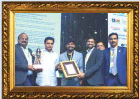
Excellence in All Round Performance Award 2022 from Federation of Telangana Chambers of Commerce and Industry (FTCCI)