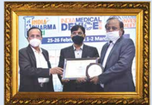
India Pharma Bulk Drug Company of the Year Award 2020 from Government of India

The Best Entrepreneur Award 2022 from Zee Business