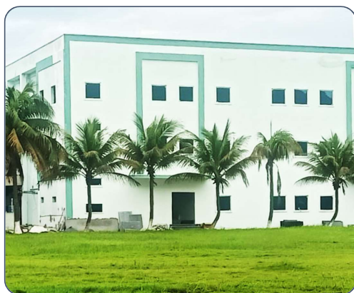
PELLETS AND DC GRANULES PLANT AT VIZAG