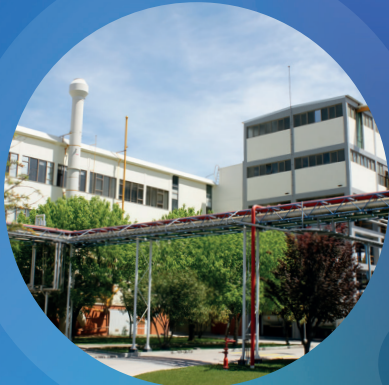
Cipan Lisbon Portugal