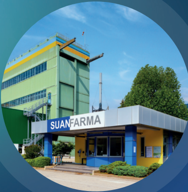
Rovereto Trento Italy